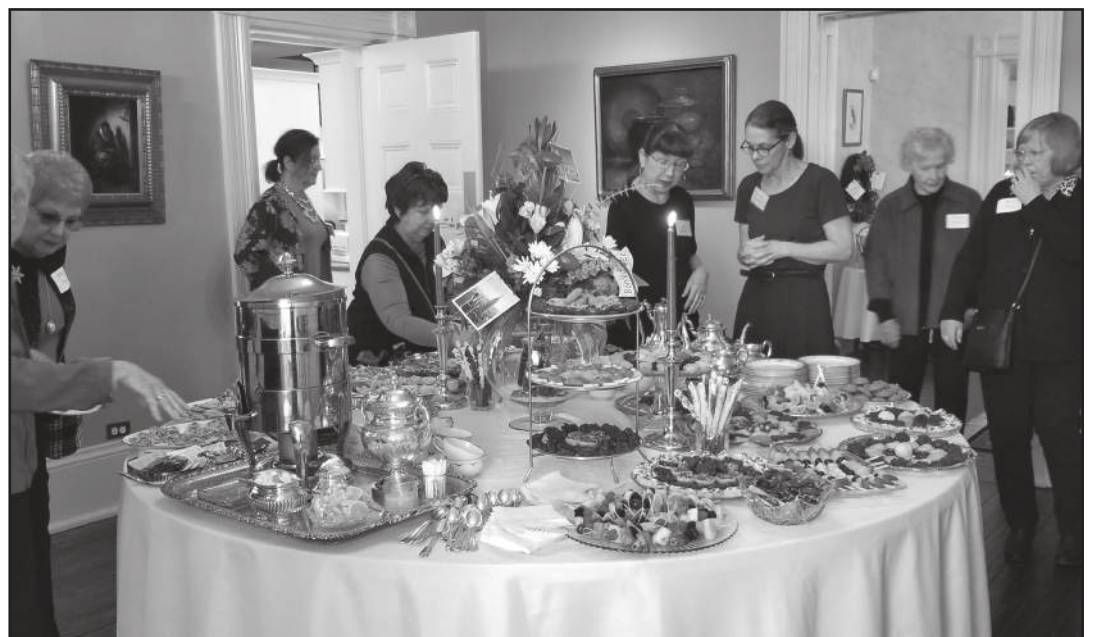
Tea attendees enjoy the sweet and savory treats served at the 2019 Holiday Tea