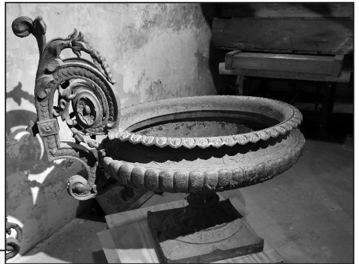
Above: The original urn from the central island of the reflecting pool. It is missing one handle and is now stored in the basement of the Study.

large oval cast-iron urn. The urn was filled and planted with a variety of plants and flowers. The Museum is scouring the internet and antique shops and talking to historic contacts in search of a reproduction of the urn. The soil will be returned to the pool, leaving a portion of the wall and capstones visible, and the interior will be planted with groundcover.