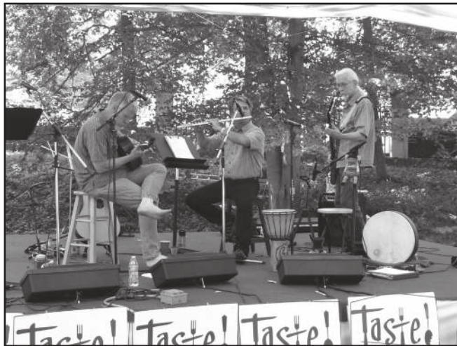
Nuthatch performs at the 2015 Taste

the "Sign Up Genius" button. We also invite you to help us spread the word by joining our Street Team. Visit the Street Team page on our website for images that can be shared on Twitter, Facebook,