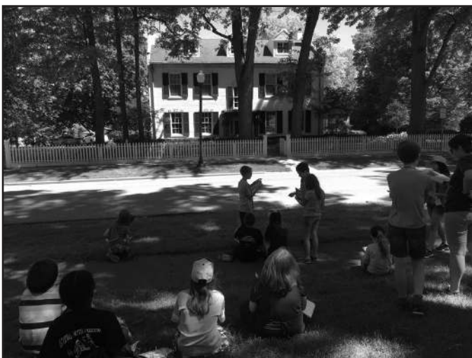
ArchiCampers learn about the Elston Homestead during a walking tour of Elston Grove