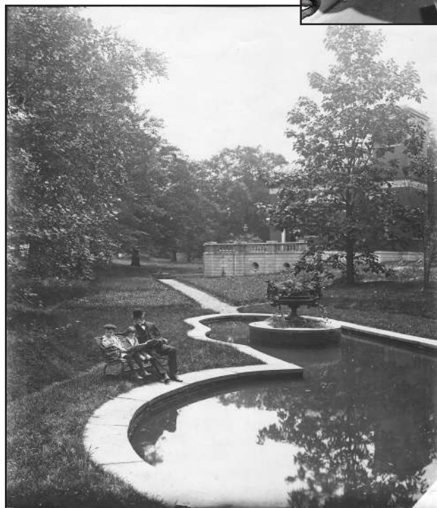
Left: Lew Wallace and his two grandsons sit by the reflecting pool.

For more information on the reflecting pool project see Notes from the Director on page 3 and the Study Scrapbook on page 11.