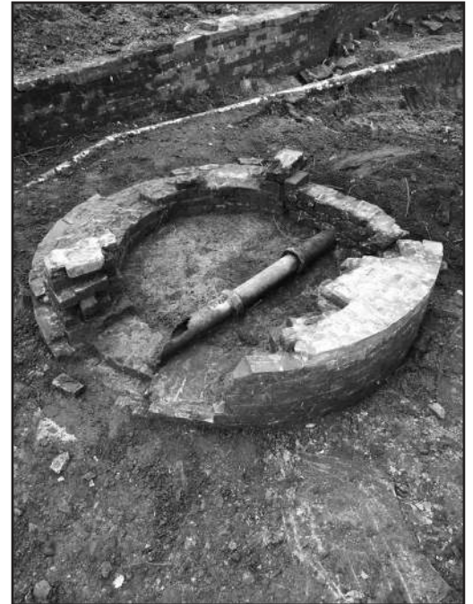
Clockwise from top right: ArchiCampers pose for a photograph at the Masonic Temple; the center island of the reflecting pool is uncovered; a view of the reflecting pool looking west; a view of the reflecting pool looking back toward the Study; members of the Brass Era Car Club visited the Study in June