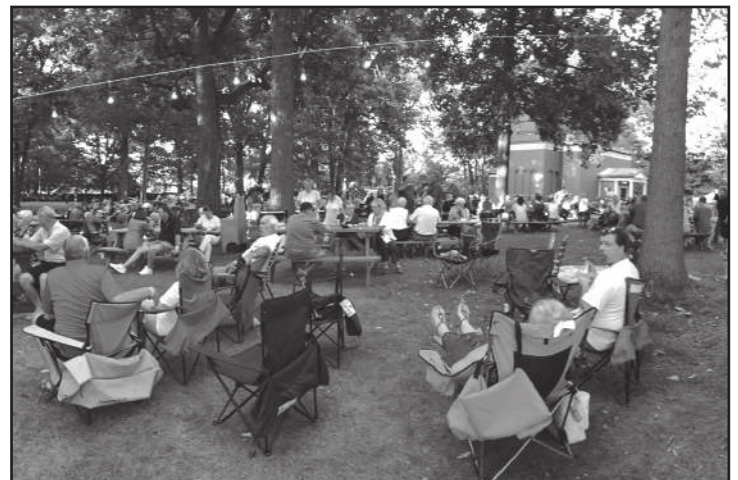
The crowd enjoyed great music and amazing food at the tenth annual TASTE of Montgomery County in 2016