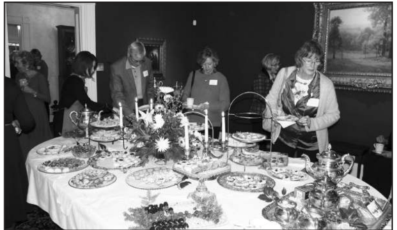
Visitors enjoy the wonderful sampling of food at the Holiday Tea in December