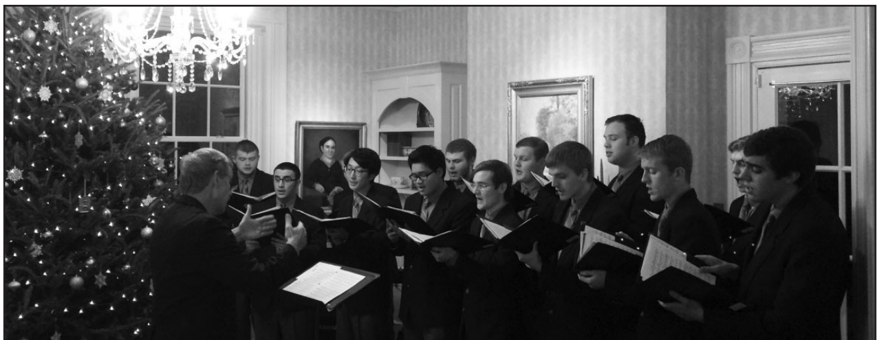
The Wabash College T-Tones performed at the Elston Homestead during the Holiday Tea