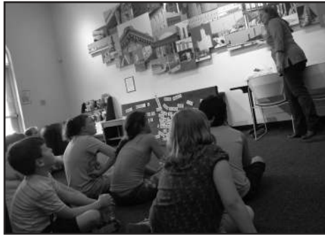
ArchiCamp Participants in 2014 learn about the mural at the Carnegie Museum

local buildings from cardboard boxes, learn about careers in historic preservation, and discuss