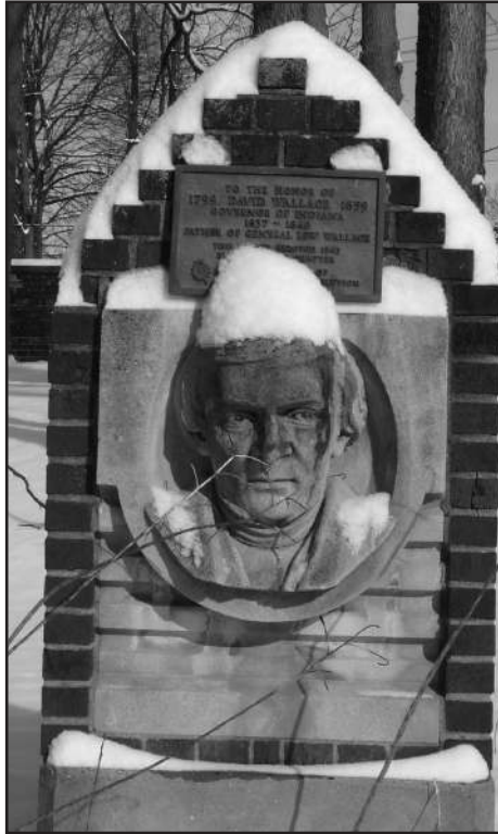
The David Wallace monument covered in snow this winter