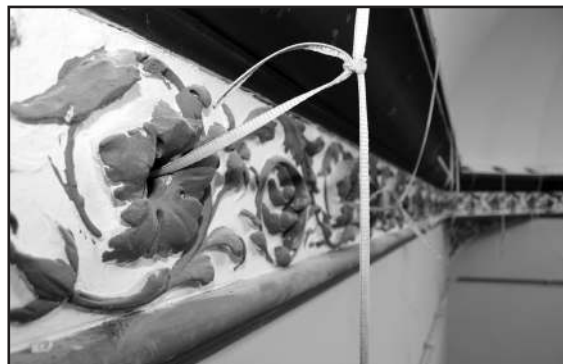
The sockets in the flower frieze are being prepared for new wiring

does not work throughout the building. We have learned much about the manner in which the plastering and original wiring was done that we will include in our institutional archives and share with interested visitors.