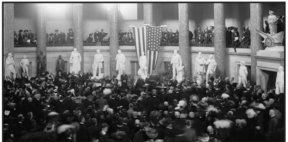
Lew Wallace Statue Dedication in Statuary Hall, Washington D.C.