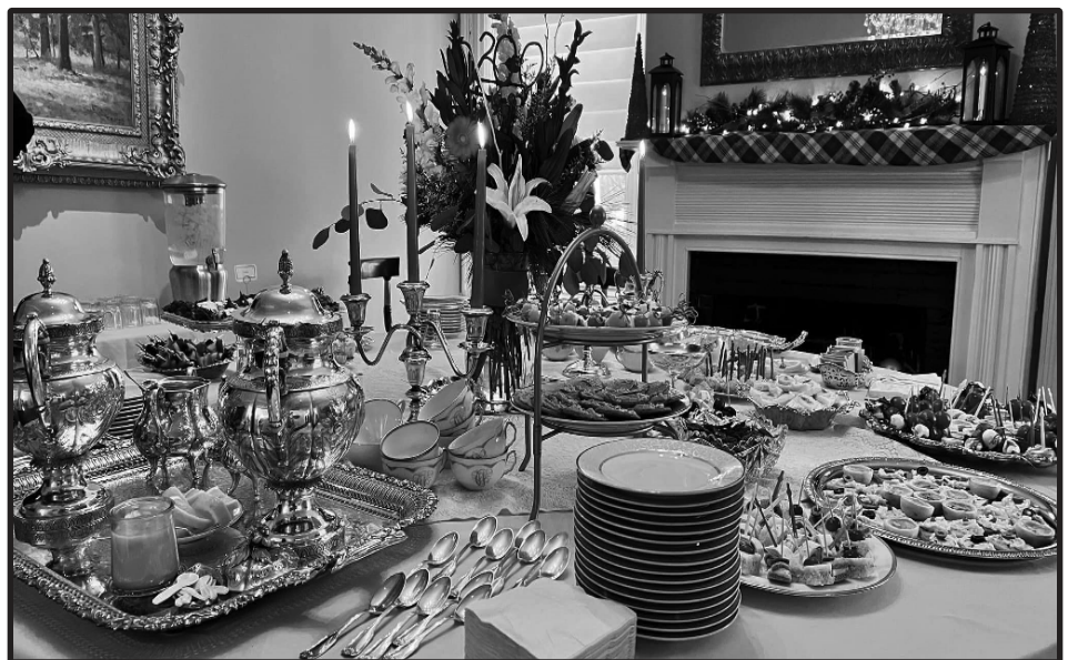
Holiday Tea Smorgasbord

Reservations for the Holiday Tea & Fashion Show are $25 per person and due November 30. To reserve places for you and your guests, call the Lew Wallace Study & Museum at (765) 362-5769 or visit www.ben-hur.com/programs/holiday-tea to purchase tickets