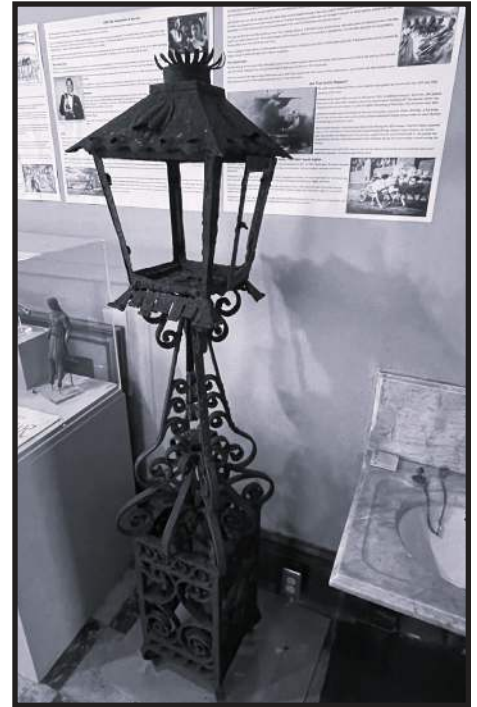
Photographs Left to Right: