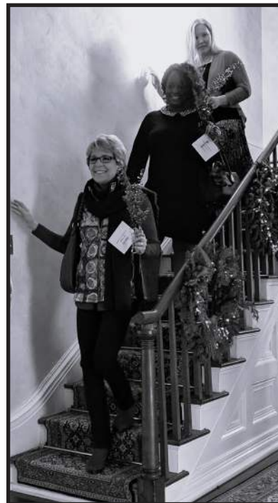
Holiday Tea Models