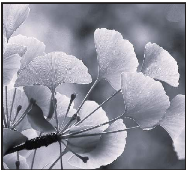
Ginkgo biloba leaves

Early snowdrops will be planted throughout the grounds as well. Snowdrops make for a great naturalized carpet of white in the early spring, growing only 4 to 10 inches tall. A mass planting of the bulbs will give the best show. A few of the snowdrops will be combined with crocus to provide a beautiful prelude to spring.